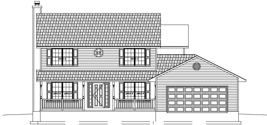
1 FRONT ELEVATION A-5 SCALE: 1/8"=1'-0"